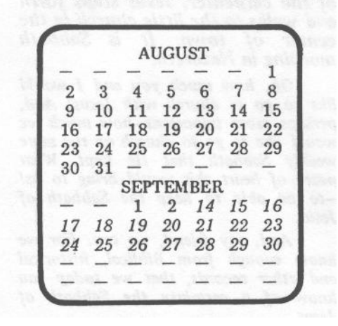
An Abundance of Evidence

How many ways may we know that the weekly cycle-and with it, the Sabbath cycle–has never been changed? Let us count them: